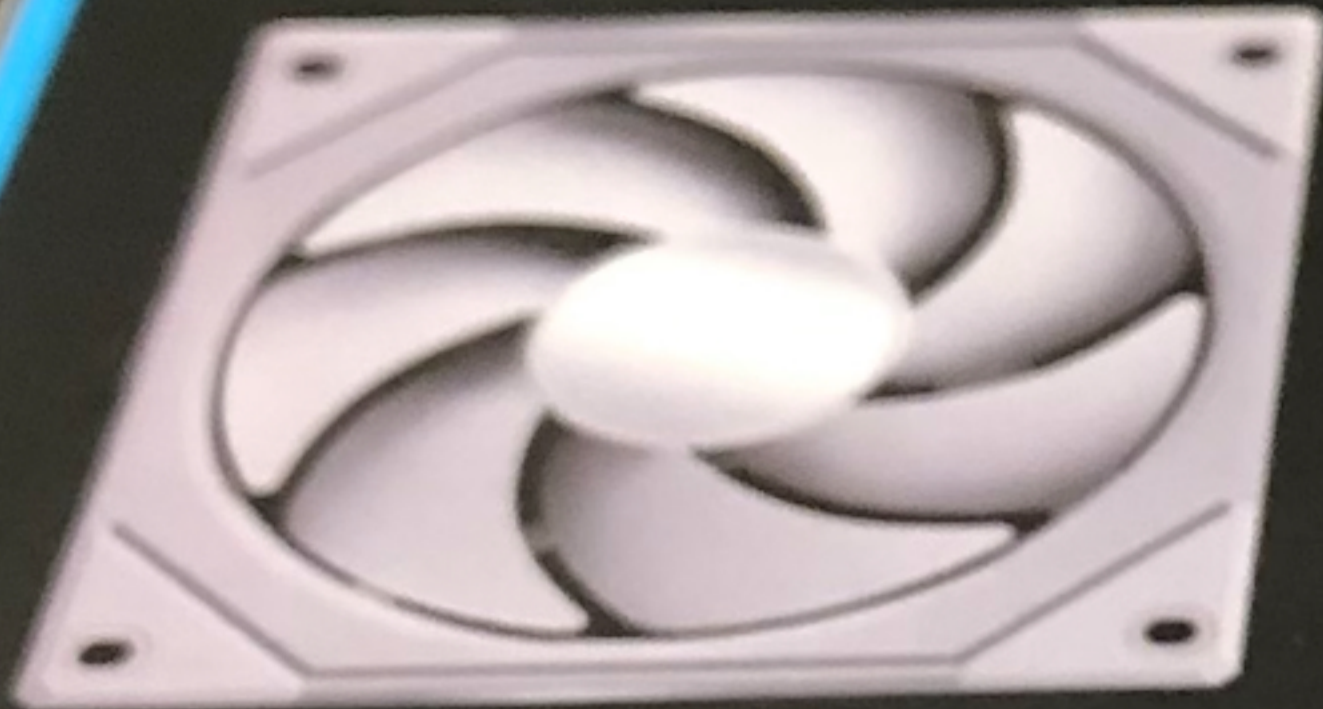
• UNI FAN SL-INF 120 mm