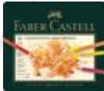
110024 (24 colours)