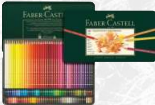
110011 (120 colours)