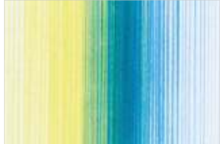
phthalo blue 110 on cadmium yellow 107

Colour gradients can be created by increasing the pressure during drawing, by covering a colour with a white or light colour pencil, or by lightening specific areas with an eraser pencil.