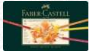
110060 (60 colours)