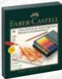
110038 (36 colours)