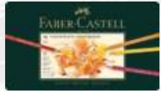
110036 (36 colours)