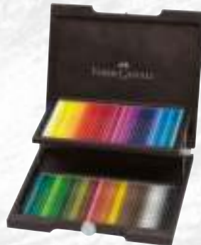
110072 (72 colours)