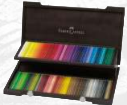
110013 (120 colours)